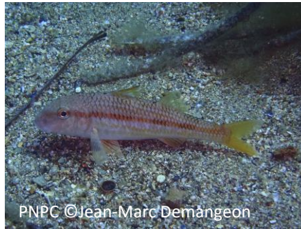
Striped red mullet Mullus surmuletus