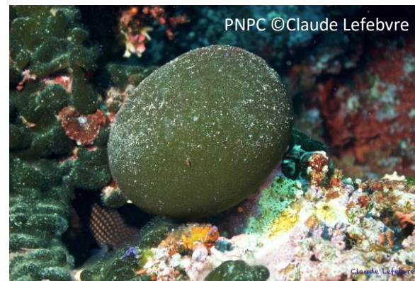
Green sponge ball Codium bursa