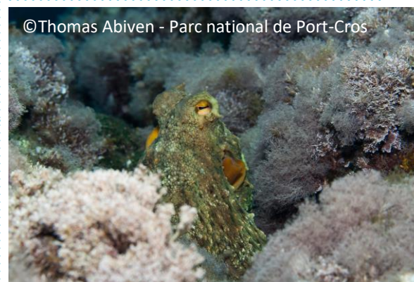
Octopus Octopus vulgaris