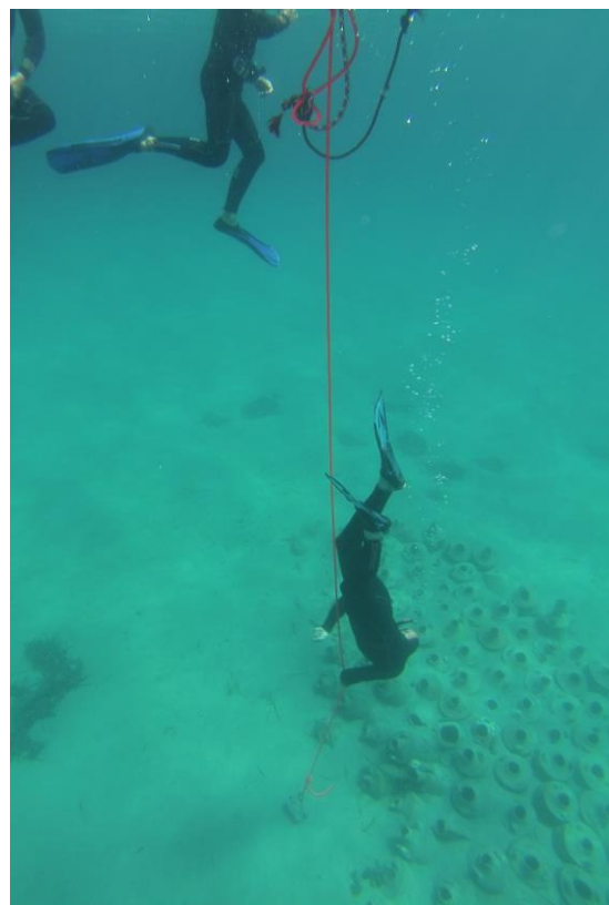
Pointe du Bouvet underwater trail Reconstituted Roman shipwreck