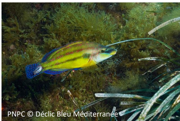
Peacock wrasse Symphodus tinca