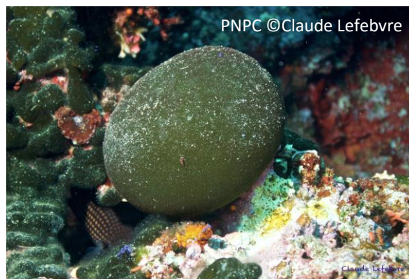
Green sponge ball Codium bursa