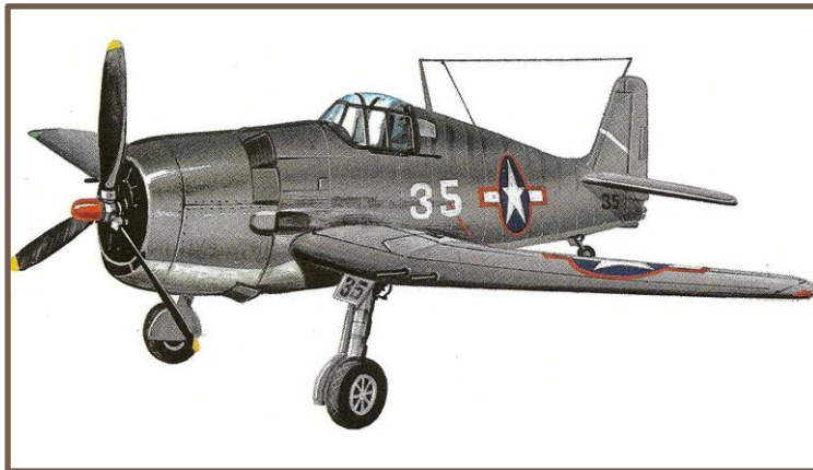
Illustration of the Hellcat @ Jean-Pierre JONCHERAY

On 14 May 1956, second master Jack Langin was at the controls. A young pilot freshly out of the American pilot school who had been assigned to the 54S squadron based in Hyères, he was carrying out a low-altitude manoeuvrability exercise in order to obtain his aircraft carrier landing qualification. An error of judgement caused him to brutally hit the surface twice. The engine stalled and the aircraft sank. The pilot was saved with a fracture. Today, the aircraft lies flat on a gentle slope amid rocks. The propellor is missing and the cockpit is open. One of the wings touches the sand and the other is in open water.