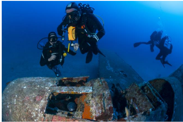
The Hellcat, Conger eel, Conger conger Parc national de Port-Cros