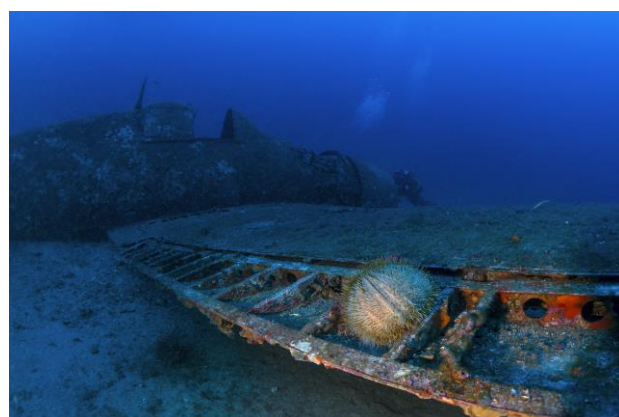
The Hellcat, melon sea urchin - Parc national de Port-Cros