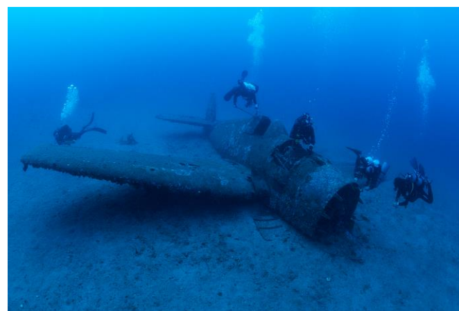
The Hellcat, ambiance - Parc national de Port-Cros