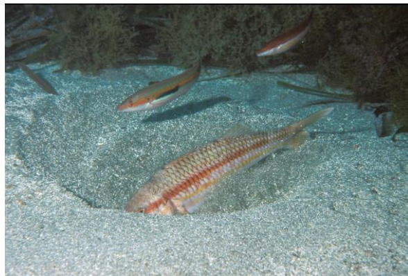
Striped red mullet, Mullus surmuletus Parc national de Port-Cros