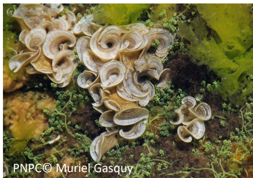
Peacock's tail Padina pavonica