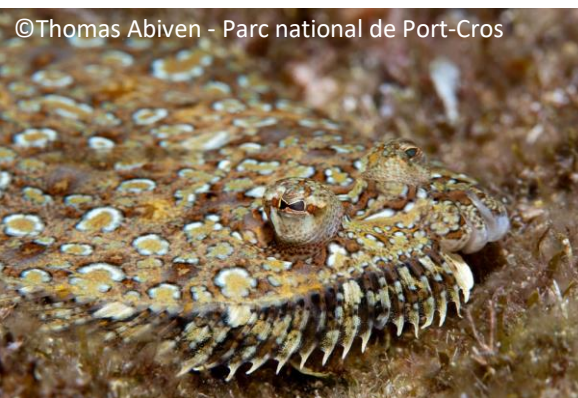
Wide-eyed flounder Bothus podas